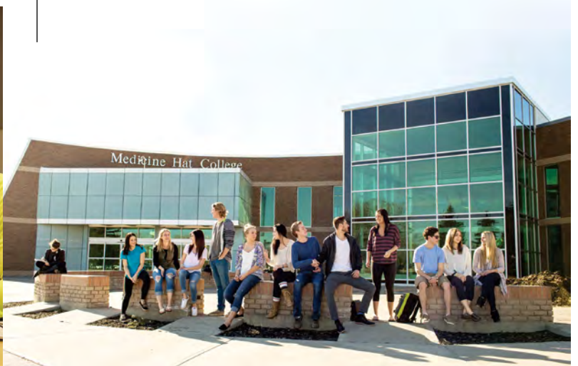
Medicine Hat College Campus